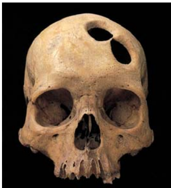
Ancient skull with holes from trephination